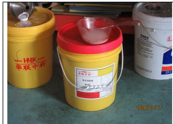
NC 7.6 No secondary container