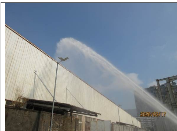
Testing of fire hydrant