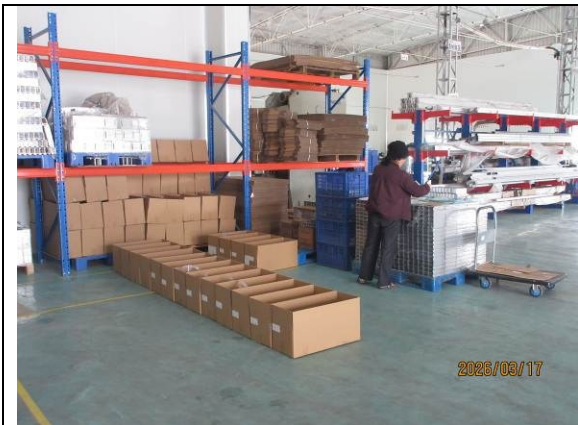
Assembling & packing workshop