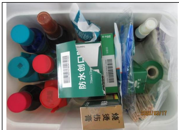
First aid kit