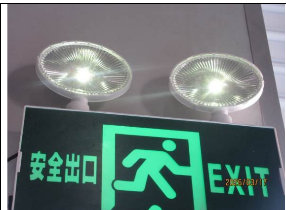
Emergency light testing