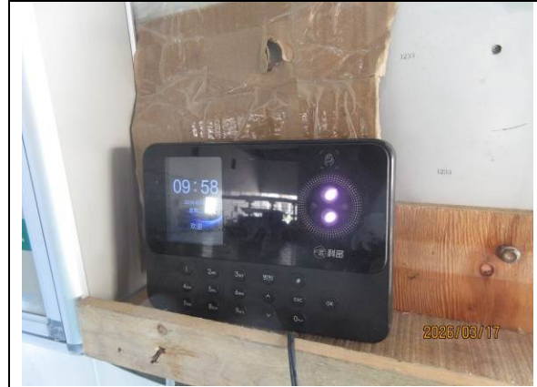
Facial scan system