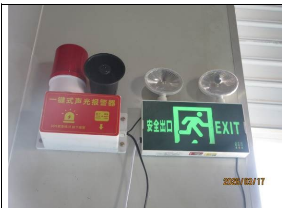
Fire alarm, safety exit and Emergency light