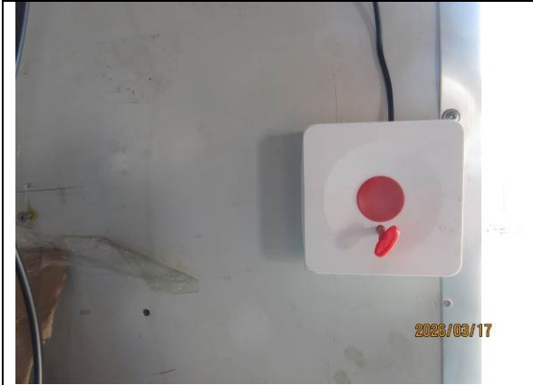
Fire alarm button