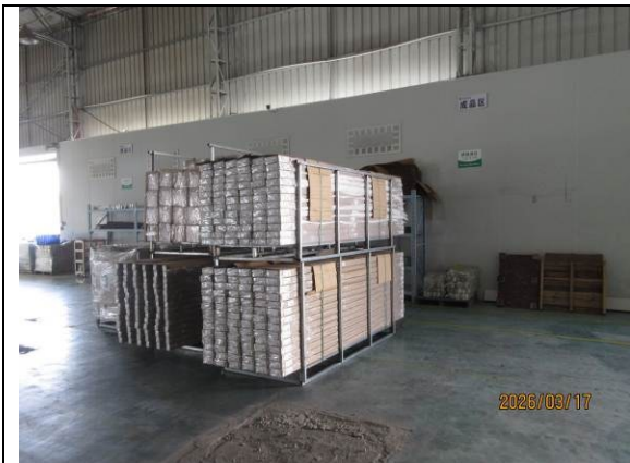
Finished goods warehouse